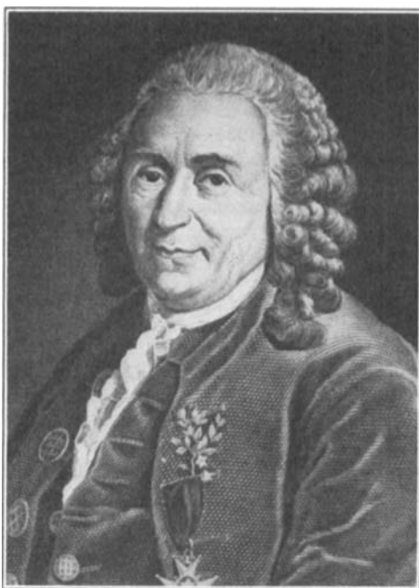
Fig. 1.—Karl von Linné.

Karl von Linné, the greatest botanist of all time, and picturesquely called by Jacob Riis, the "King of the Flowers," was born in a little country parsonage, at