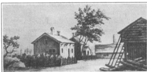
Fig. 2.—Linné's Birthplace.

Carolus Linnæus Smolandus. Carl Linnæus Carl v. Linné Carl Linné Carol Linne